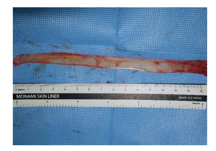
Fig. 2. Harvested fascia lata strip 15×1 cm in size.

The patient's lip was more symmetrical with the mouth either opened (Fig. 4A) or closed (Fig. 4B) at 1 year after the correction surgery (Supplemental Video S1). The operative scar is inconspicuous, and his left thigh shows minimal donor-site morbidity.