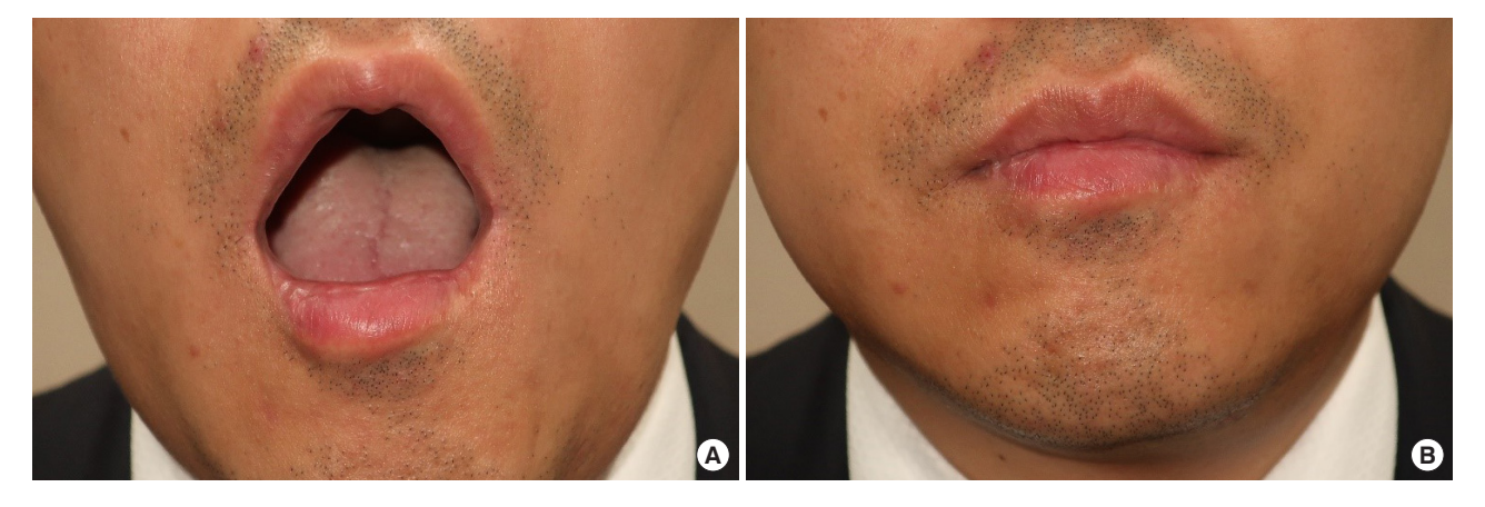
Fig. 4. (A, B) Postoperative appearance of opened and closed mouth 1 year after surgery.