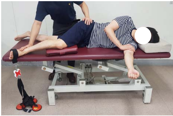
Figure 1. Ankle evtor measurement position and the Smart KEMA sensor position.

Inc., Seoul, Korea) was used to measure the isometric ankle evtor strength. This sensor is a tensiometer that measures the force at which both ends are pulled and the measuring range is 0~1960 N (Ahn et al, 2018; Kim et al, 2017). To measure muscle strength, a 5-cm wide strap, which is attached to one end of the sensor is applied on the subject's forefoot, and the length-adjustable belt attached to the opposite side of the sensor is fixed to the floor (Ahn et al, 2018). For all subjects, the tension at the starting position was adjusted to 2 kgf in order for all subjects to start at the same tension (Ahn et al, 2018). The Smart KEMA strength sensor has a high intra-rater reliability (ICC=.85~.98) (Kim et al, 2017).