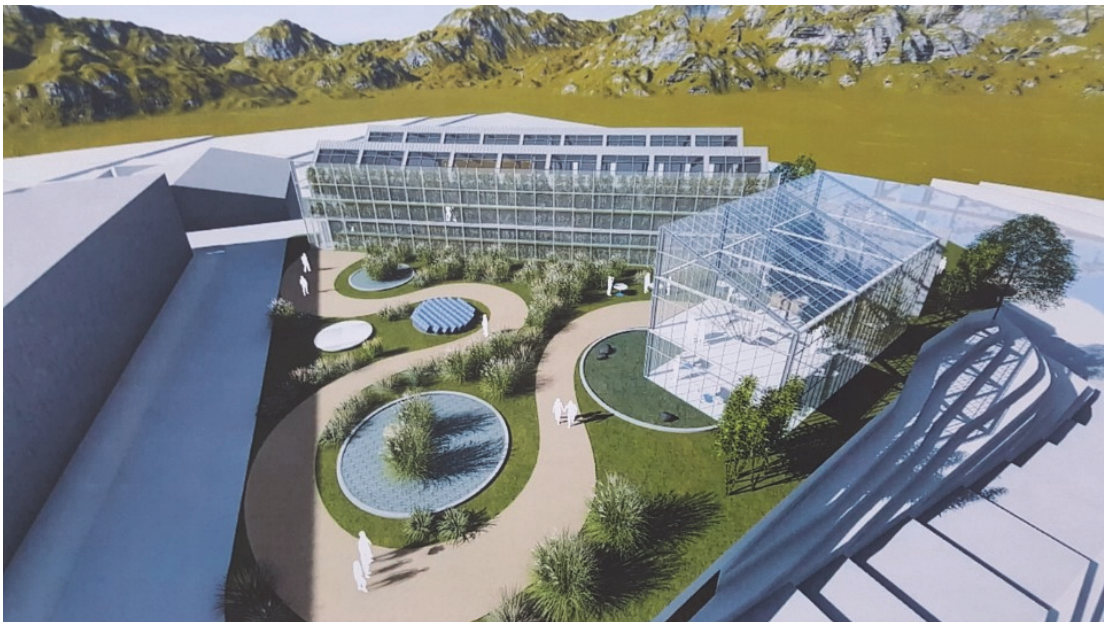
<Figure 4> Panoramic View of SevenBräu Yangpyeong Factory

Regarding communication strategy, it is necessary to select appropriate channels and