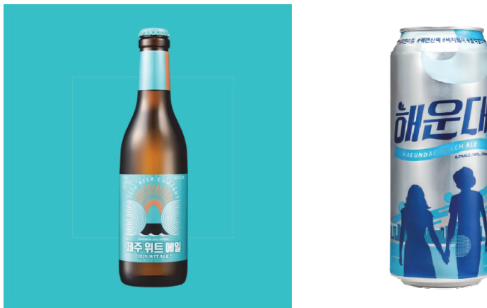
〈Figure 3〉 Competing Products of SevenBräu

It is important for SevenBräu to position its brand and products as that of a representative craft beer in the minds of consumers to sustain its growth in the beer market. To this end, brand hierarchy management and brand reinforcement are necessary. Strategies for the short and long terms have to be established on how the brand image is to be delivered to consumers by brand hierarchy: specifically, corporation (e.g., SevenBräu), product group (e.g., IPA), and product (e.g., Gangseo Mild Ale). In addition, it is necessary to discuss how brand elements (to which opinion leaders would be responsive, such as “high quality,” “diversity,” and “innovativeness”) should be added to counter the negative implications consumers might have, in association with the brand’s present image as a “locally produced