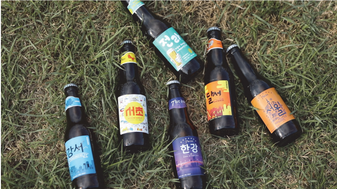
<Figure 2> SevenBräu's Region-Labeled Products

places such as Namdaemun Gate, N Tower, National Assembly, 63 Building, and Lotte World Mall.