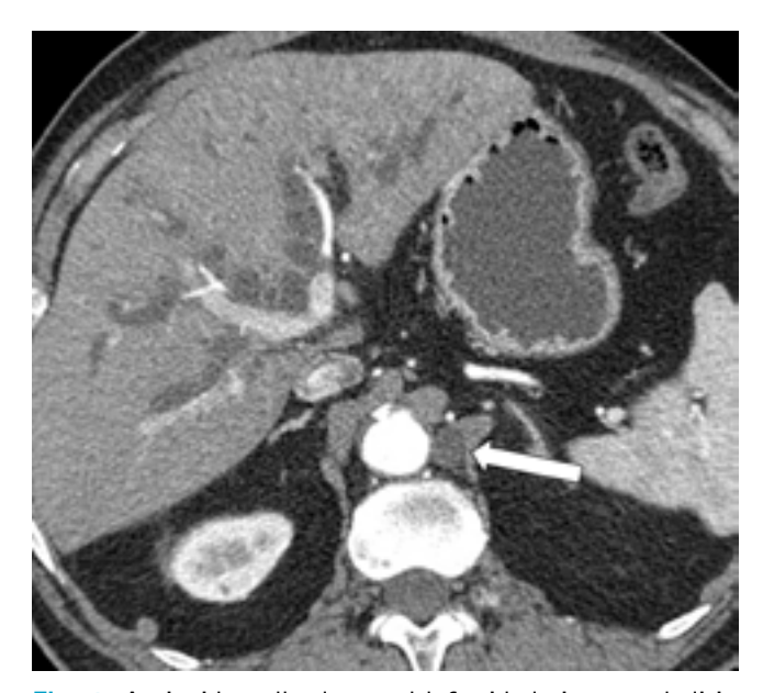
Fig. 1. An incidentally-detected left-sided cisterna chyli in a 76-year-old man. Contrast enhanced CT image showed a well-defined non-enhancing lesion (arrow) measuring 1.2 x 1.4 x 2.5 cm of near-water attenuation. It was located in the left retrocrural space between the T12 and L1 vertebral level.

level. MR imaging with MR cholangiopancreatography (MRCP) obtained for further workup of cholangiocarcinoma using 3.0 Tesla system. Respiratory-triggered coronal T2-weighted single-shot fast spine-echo image and breath-hold three-dimensional gradient and spin-echo (GRASE) MRCP image revealed that the left retrocrural lesion appeared as an elongated structure with uniform T2 high signal of its contents, similar to the cerebrospinal fluid (CSF) (Fig. 2). The lesion was consistent with a left-sided cisterna chyli joined by dilated lumbar lymphatics. The left-sided thoracic duct was continuous with the left-sided cisterna chyli, entering through the aortic hiatus of the diaphragm. On follow-up CT 6 months later, there was no change in the appearance of the left retrocrural lesion.