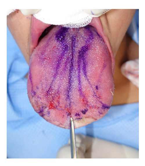
Fig. 3. Design of partial glossectomy by anchor-shaped combination of a U-shape and modified key-hole resection.

Reduction glossectomy was planned with anchor-shaped combination of a U-shape and modified key-hole resection (Figs. 3, 4). The incision was executed using a surgical scalpel; hemostasis was completed with electrocautery. The excess tongue muscle tissue was resected. The tongue was closed using absorbable 5-0 Vicryl sutures (Ethicon, Bridgewater, NJ, USA) (Fig. 5). Postoperatively, the reduced tongue was contained completely within the oral cavity, but an open bite remained as