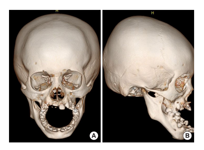
Fig. 2. Preoperative computed tomography revealed prognathism and class III malocclusion. (A) Anteroposterior view and (B) lateral view.

nea but was uncomfortable with oral intake and had limited communication due to dysarthria. The patient was not able to close his mouth properly and was constantly drooling. In preoperative facial bone three-dimensional computed tomography (3D-CT), diastema, tooth spacing, prognathism, and class III malocclusion were noted, but other skeletal deformities were not significant (Fig. 2). Neck CT revealed probable hemangiolymphangioma involvement in both the right parotid gland and right parapharyngeal space.