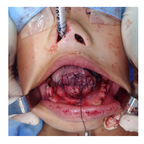
Fig. 5. Immediate postoperative clinical picture: the tongue was contained completely within the oral cavity. In this picture, the tongue was retracted by suture material for visualization.