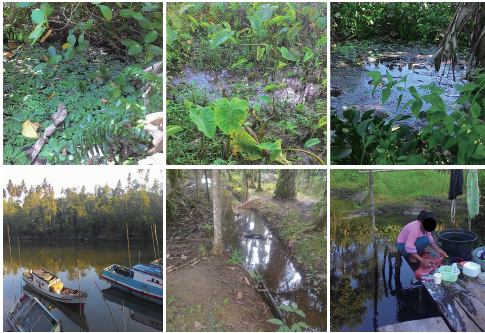
Fig. 3. Mosquito breeding-sites in Lasar and Suak Gual villages.

control programme and formal post-MDA surveillance.