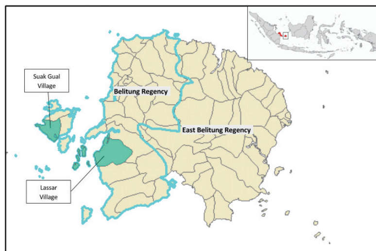
Fig. 1. A map showing study areas, Lasar and Suak Gual villages.

Night blood samples were collected from the consenting individuals between 8 PM and 12 PM. Prior to the survey, the survey team visited the village and discussed with the commu-