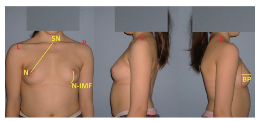
Fig. 2. Three morphological parameters on breasts profile : 1) sternal notch-nipple distance (SN-N); 2) nipple-inframammary fold distance (N-IMF); and 3) breast projection (BP) (patient No. 12).