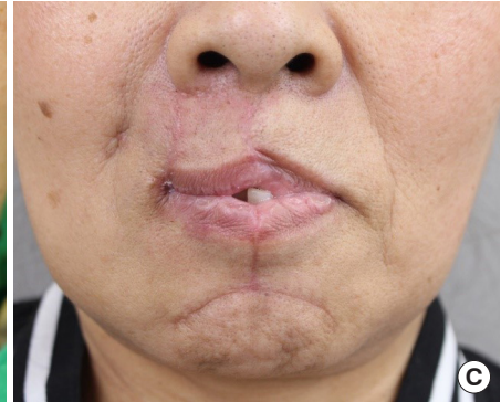
Fig. 3. To correct the drooling and lip seal due to the resultant upper lip defect and scar contracture, scar release and Abbe flap coverage were planned. (A) Six months later, Abbe flap surgery was performed for delayed reconstruction of the upper lip. (B) Immediate postoperative view. (C) Three-month follow-up view.

nodule in the right upper lobe, which may have resulted from septic emboli originating from the upper lip infection (Fig. 1C). The Laboratory Risk Indicator for Necrotizing Fasciitis score was 10 points, placing the patient in the high-risk category; this measure considers C-reactive protein level, white blood cell count, serum hemoglobin, glucose, sodium, and creatinine level. Due to an impression of septic shock as a result of the upper lip NF, immediate surgical intervention was planned. Debridement under general anesthesia confirmed full-layer necrosis of the upper lip including the orbicularis oris muscle (Fig. 2A).