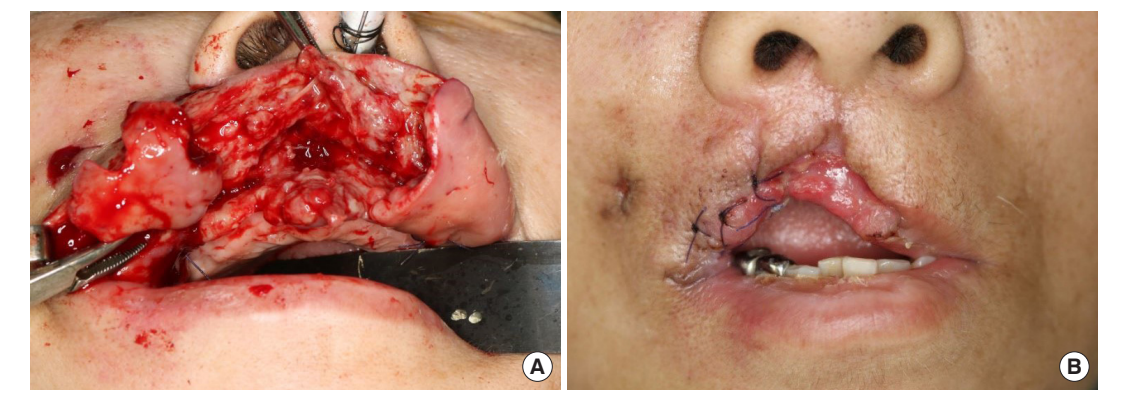
Fig. 2. Several debridements under general anesthesia were performed. (A) Intraoperative view showing full-layer necrosis of upper lip including orbicularis oris muscle. (B) After serial debridement, almost half of the entire upper lip was affected with a full-layer skin defect with scar contracture.