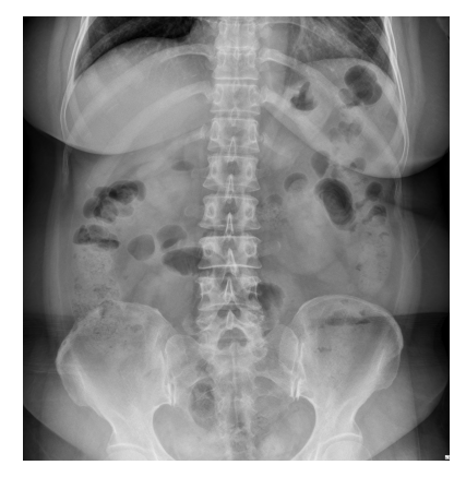
Fig. 1. Abdomen erect view.

The patient complained of tenderness in the entire abdominal area, and stated that she had diarrhea >5more than five times a day with an improvement in the symptoms after bowel movements. She complained that she suffered from loose bowel movements with pain of approximately 10 numerical rating scale