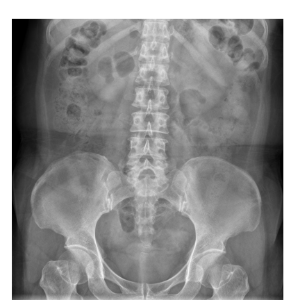
Fig. 2. KUB view.

(NRS) before defecating (this reduced to 8 NRS when she did not defecate) and had a dull stomachache for approximately 3 months. The patient was diagnosed with IBS using the Rome IV diagnostic criteria (Table 2), and local guidelines that allowed dietary control, nonpharmaceuticals, and medication of up to 4 weeks without performing colon endoscopy when there were no specific symptoms in the blood test and no warning signs, such as melanorrhagia, and weight loss with unknown cause [1,9].