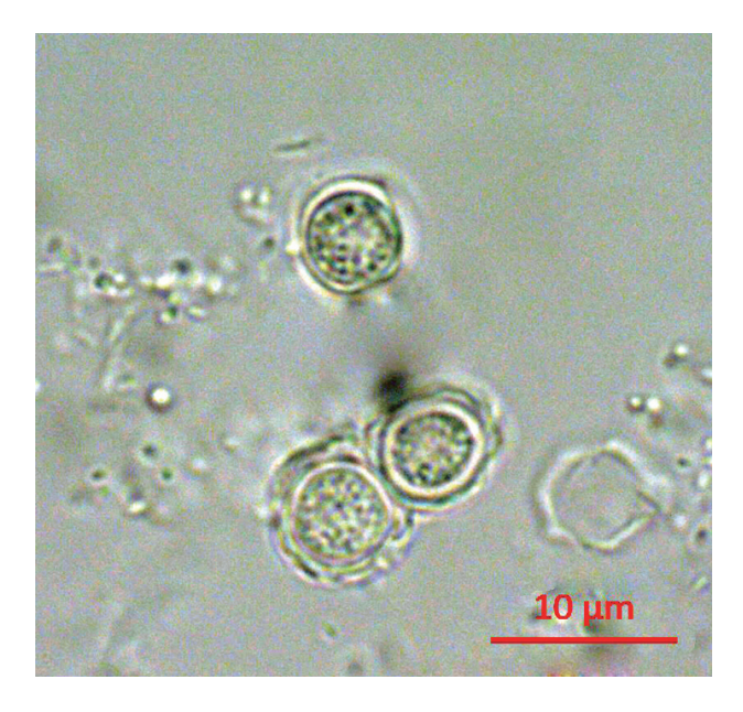
Fig. 1. Morphology of cyst of KFA 2.

Following the analyses, we found that 21 out of 163 (12.9%) tap water samples were contaminated with FLAs. The shapes of the cysts were very similar each other; the size of cysts were belong to 5-25 \mu m and they have 2 layers of membranes commonly (Fig. 1). FLAs were detected in 4 samples from apartments (10.8%), 9 samples from office buildings (8.8%), and 8 samples from highway service areas (33.3%) (Table 1). The observed FLA contamination rate was higher for