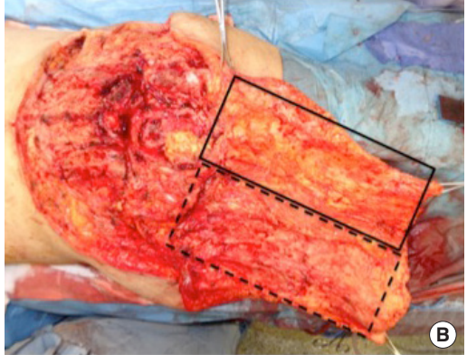
Fig. 3. Subtotal extended thigh flap (A), containing a myofasciocutaneous anterolateral portion (solid line) and a fasciocutaneous medial portion (dashed line) (B).