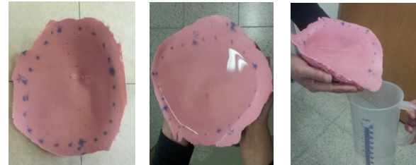
Fig. 2. Measurement method of breast volume

volume measurement was repeated three times to calculate the average.