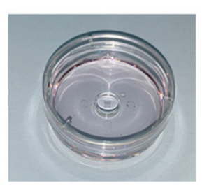
Microwell culture (DNP, humid culture)