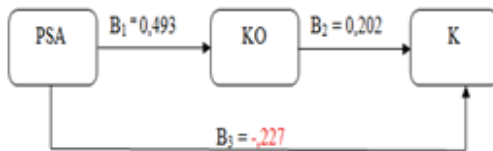
Figure 3. Path Analysis Results 2