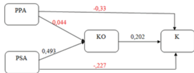
Figure 1. Path Analysis Results

Figure 1 presents a complete picture of the sub-structure along with path analysis.