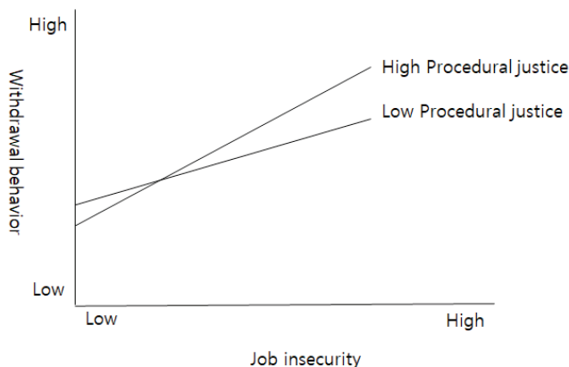
Figure 2: Interaction Effects

easily affected by the perception of job insecurity, thus the will to change oneself is very low. Fourth, as the assessment of the moderating effect of procedural justice, within the process of understanding the impact of job insecurity perception on withdrawal behavior, the suggested hypothesis was not supported - the more sensitive to the perception of job insecurity, the more negative is the individual in regards to the outcome on withdrawal behavior. If the perception of job insecurity is low, whether the perception of procedural justice is high or low, there is no meaningful effect on withdrawal behavior. But, if it is the opposite, the employee whom has a higher awareness to the perception of procedural justice, will inevitably face a stronger aftermath in its withdrawal behavior. Once again, we would like to stress that just because one has a high perception of procedural justice that automatically the individual will have a negative effect on the individual's withdrawal behavior. Herewith, depending on the scope of the individual's awareness of job insecurity perception, the procedural justice of the relations between job insecurity perception and withdrawal behavior tend to deliver differing results.