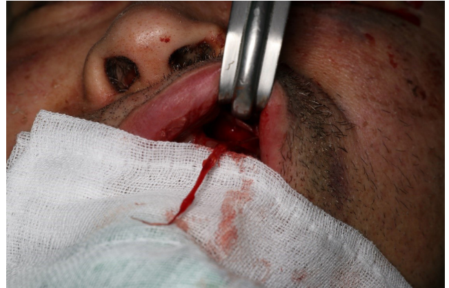
Fig. 3. The avulsion injury of inferior orbital nerve was confirmed from the intraoperative finding.

nerve was confirmed from the operative findings (Fig. 3). Microsurgical repair was not performed. The identified proximal portion of the distal nerve ending was located toward the infra-