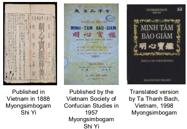
Published in Vietnam in 1888 Myongsimbogam Shi Yi

In Vietnam, the Myongsimbogam published in 1998. In this version, each sentence is interpreted and rendered phonetically in Vietnamese(Figure 3). In Vietnam, this book was used as an important textbook for cultivating individual morality and promoting the good customs of society.