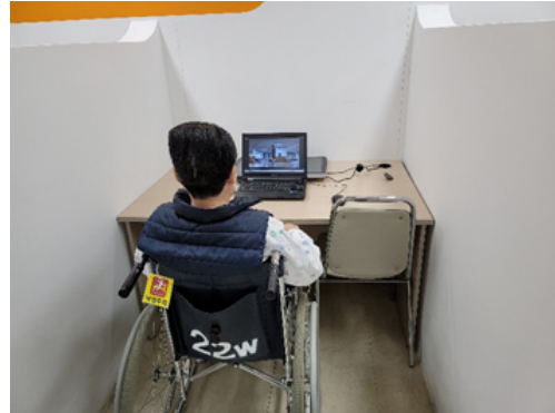
Fig. 2. Participant undergoing action observation training.

rehabilitative session by a physical therapist.