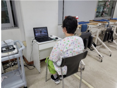
Fig. 1. Participant watching the functional walking tasks video with acoustic stimulation.