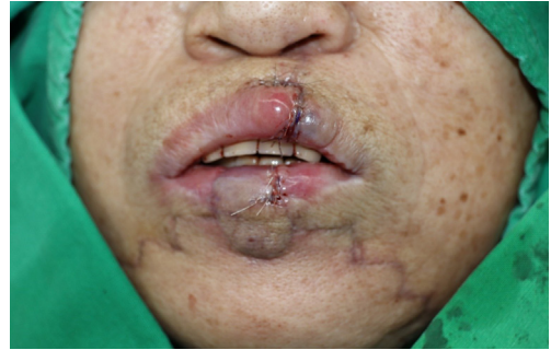
Fig. 5. After division of the Abbe flap pedicle 16 days postoperatively.

Surgical management of oral squamous cell carcinoma typically involves resectioning the carcinoma with a 0.4 \times 0.6 cm margin of normal-appearing tissue [6]. Large surgical defects are often encountered. Reconstruction methods for the lower lip vary