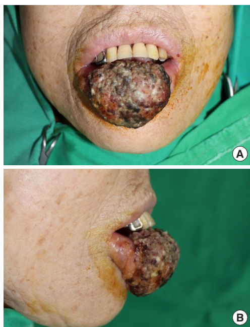
Fig. 1. Preoperative photographs of an 81-year-old woman with a tumor in the lower lip. (A) Anterior view. (B) Lateral view.

other hospital, and squamous cell carcinoma was confirmed. The tumor location was central and did not invade the commissure area. The tumor was pedunculated, being 5 \times 4 \times 2 \text{ cm}^3 in dimensions, with a diameter of 4 cm of the stalk. The total lip width was 6 cm (Figs. 1, 2). Results of imaging examinations indicated suspected pathologic lymph nodes at levels I and II on both sides of the neck. After consulting with the otorhino-