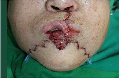
Fig. 4. After making an additional incision along the upper vermilion border to resolve congestion of the Abbe flap within 24 hours postoperatively.

In the second stage, the Abbe flap that is pedicled to the superior labial vessels was designed next to the left philtrum column to avoid damaging the philtrum shape. The flap was pentagonal (width, 1.5 cm). The lateral side of the flap was completely divided, and the location of the superior labial artery was confirmed. The medial side of the flap was carefully dissected until the superior labial artery had been identified and preserved. This permitted the easy rotation of the flap onto the central lower lip defect. The upper lip was primarily sutured layer by layer, with careful attention and precision around the pedicle (Fig. 3B).