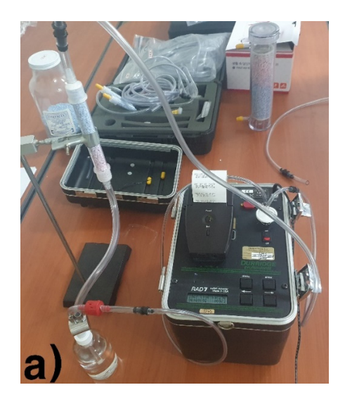
Fig. 1. Set-up measuring radon in water(a), and Po series spectrum(b)

Since the sample was in the form of a liquid, it was studied with the aim of increasing the accuracy of the radon concentration measurement by removing the moisture in the bubble, blowing the bubble through the glass frit and passing it through a drying tube. The collected sample was confined to a 250 mL vial and the experiment was conducted by obtaining 10