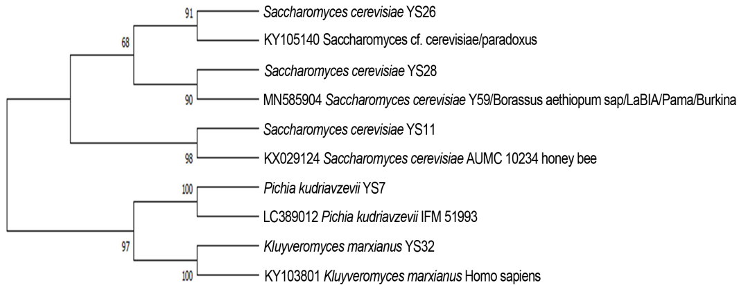
Fig. 1. Phylogenetic tree reconstruction of yeast strains studied using the Neighbor-Joining method based on ITS sequences in MEGA X program. Numbers on the branches indicate bootstrap percentage after 1000 replications.

volume of 2.95 cm 3 /g, significantly ( p < 0.05 ) higher of that of control yeast in the first half hour of fermentation. The five yeast cultures were identified by sequencing the ITS regions. The analysis of similarity percentages on the Gene Bank BLASTN database showed that the isolates YS11, YS32, YS26, YS28 and YS7 were identified as S. cerevisiae (KX029124), K. marxianus (KY103801), S. cerevisiae (KY105140), Saccharomyces cerevisiae (MN585904) and Pichia kudriavzevii (LC389012), with a similarity percentage of 99.42%, 100.00%, 99.26%, 99.45% and 99.80% respectively. The molecular evolutionary relationship among the yeast species is illustrated on the phylogenetic tree constructed using the Neighbor-Joining method based on ITS sequences (Fig. 1). Three of the five performing species belonged to the genus Saccharomyces (YS11, YS26 and YS28). These results are consistent with numerous studies that describe S. cerevisiae as a suitable leavening agent for the preparation of baked products [32]. K. marxianus YS32 showed a significant increase in dough volume, confirming a previous report [33], where K.