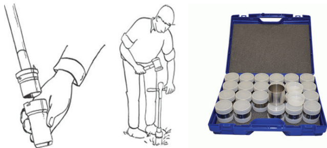
Fig 3. Core sampler for soil sampling.

Chernobyl accident, a sharp edge ring was used to collect soil by inserting it into the soil surface on the one sharp side [5]. Even in the case of the Fukushima nuclear accident, when collecting soil samples to monitor the contamination of the surrounding soil, as shown in Fig. 3, a stainless steel cylindrical core with a sharp cross-section was attached to the Core Sampler and samples of 100 mL were collected [10]. Therefore, it is expected that the core sampler shown in Fig. 3 can be selected and used as a soil sampling tool for verification of nuclear activity. This sampler can provide a suitable range of 100 ml volume samples to a depth of 5 cm; teams will use a separate stainless steel core at each sampling point to prevent cross-contamination. In addition, by attaching lids on the upper and lower parts, making it easy to seal and transport, the core can be used not only as a sample collection tool but also as a container for storing and moving samples. The core sampler, which is the main body, has a height of about 20 cm, which is considered appropriate because it involves only a slight burden to collect and move the sample.