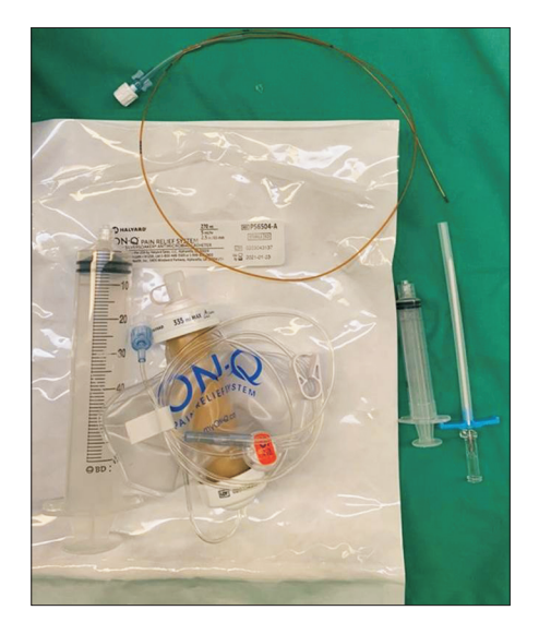
Fig. 1. The components of On-Q system (indwelling catheter and elastic pump, Halyard Health, Alpharetta, GA).

We collected data regarding pain intensity, as assessed before the operation, upon returning to the recovery room (H0), and at postoperative 12 hours, 24 hours, 48 hours, and 1 week, using a VAS score from 0 (no pain) to 10 (worst pain). We assessed the pain intensity at the abdominal and posterior lumbar surgical sites separately, at rest and during movement (coughing, turning, or walking). The sleep