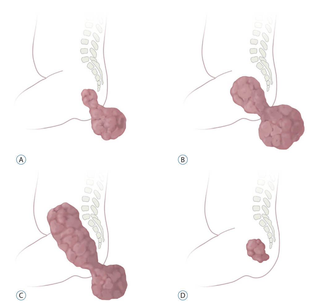
Fig. 2. Altman classification of sacrococcygeal teratoma according to the anatomical configuration. A : Type I : predominantly external with small internal components. B : Type II : dumbbell-shaped tumor with similar internal and external components. C : Type III : predominantly internal and smaller external components. D : Type IV : exclusively internal (intrapelvic) tumor.