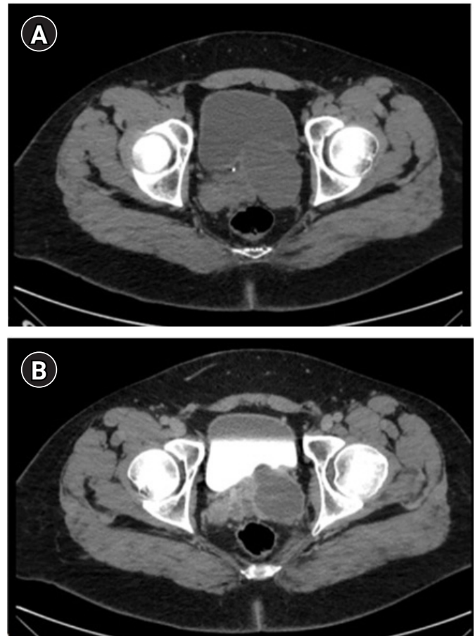
Figure 2. Abdominal contrast-enhanced computed tomography (CT) scan showing a left seminal vesicle pseudocyst. (A) Non-contrast CT. (B) CT urogram.

ZS is often asymptomatic until the age of peak sexual and reproductive activity, usually after repeated failure to achieve natural conception. Incomplete EDO, which occurs in approximately 4% of these patients, can cause seminal abnormalities, which create difficulties in diagnosis [15]. In our study, in two patients, the diagnosis was made