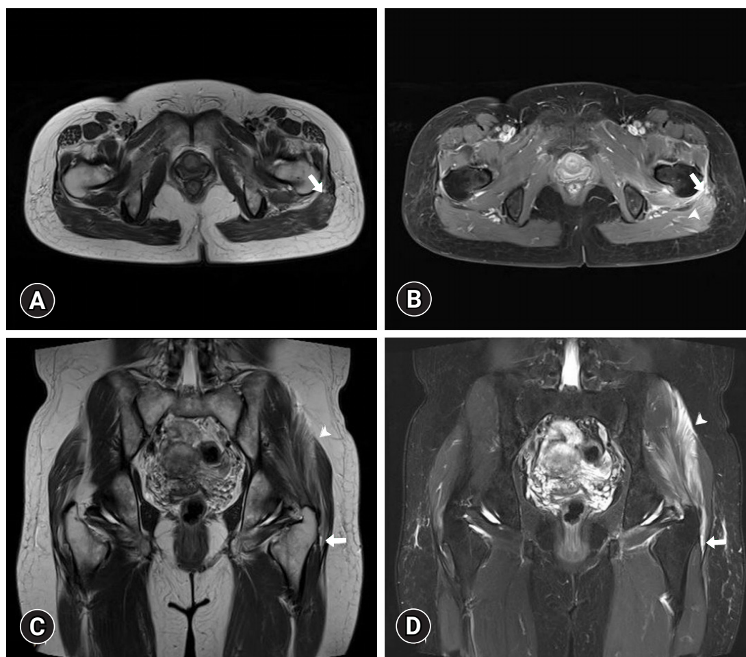
Fig. 2. (A, B) Axial T2- and gadolinium-enhanced fat-suppressed T1-weighted magnetic resonance images (MRIs) at the level of the lateral facet of the greater trochanter of the left femur. A partial tear of the left gluteus maximus muscle at its insertion site in the left iliotibial band is observed (arrows). Fluid infiltration around the site of the tear (arrowhead), suggesting edema or hemorrhage, is also observed. (C, D) Coronal T2- and fat-suppressed T2-weighted MRIs at the level of the lateral facet of the greater trochanter of the left femur. There is a partial tear at the myotendinous junction of the left gluteus maximus and iliotibial band (arrows) with intramuscular feathery fluid infiltration in the left gluteus maximus (arrowheads) suggesting grade 2 muscle strain.

This report describes a case in which a diagnosis of a gluteus maximus tear was confirmed with US and MRI. The gluteus maximus is the largest muscle in the gluteal region and plays an important