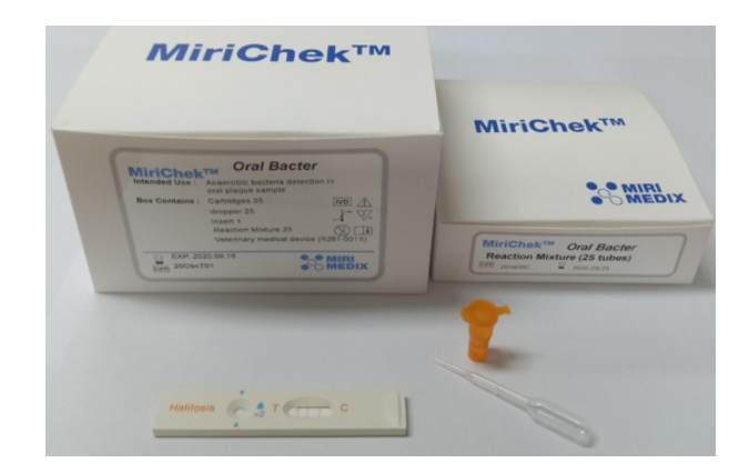
Fig. 1. MiriChek<sup>™</sup> Oral Bacter test kit

The O-Bacter test kit was provided by Mirimedix Incorporation <Fig. 1>. Specimen collection and procedures were performed according to the manufacturer's instructions.