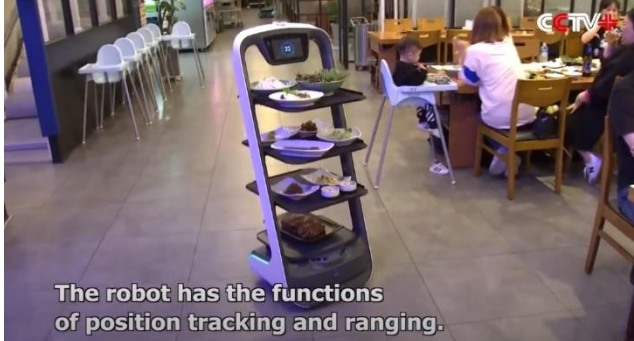
Snap Shot retrieved from https://www.youtube.com/watch?v=EW19h53uqHU