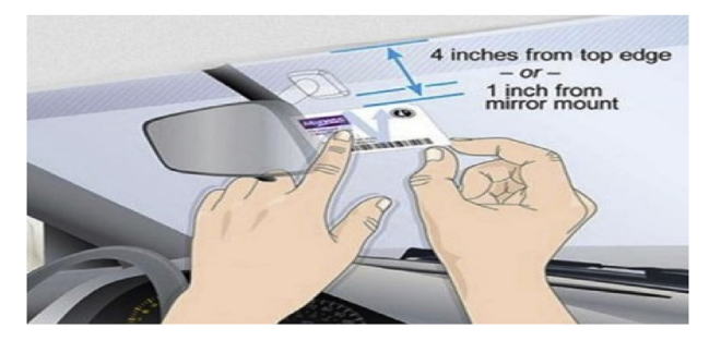
Perceived Ease of use