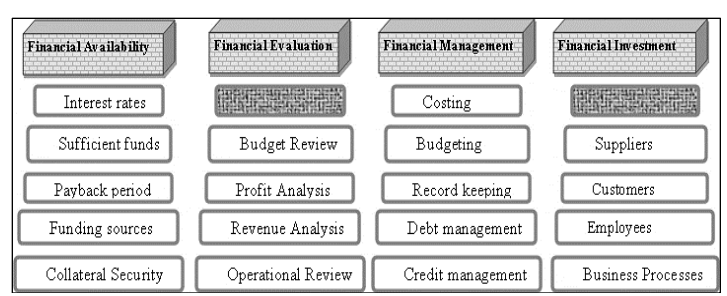
Figure 1: The Building Blocks of the Financial AMEI Constructs

making investments for the future (financial investment). Figure 1 depicts the building blocks of the model.