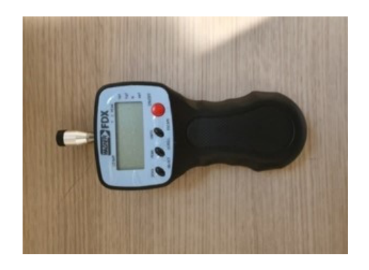
Fig. 1. Algometer used in the study Korea, pain assessment scale.