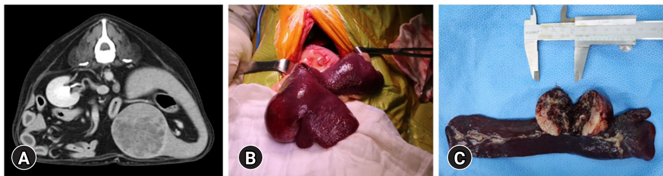
Fig. 1. (A) Splenic mass in preoperative computed tomography. (B) Intraoperative finding of splenic mass. (C) Gross appearance of the resected splenic mass.