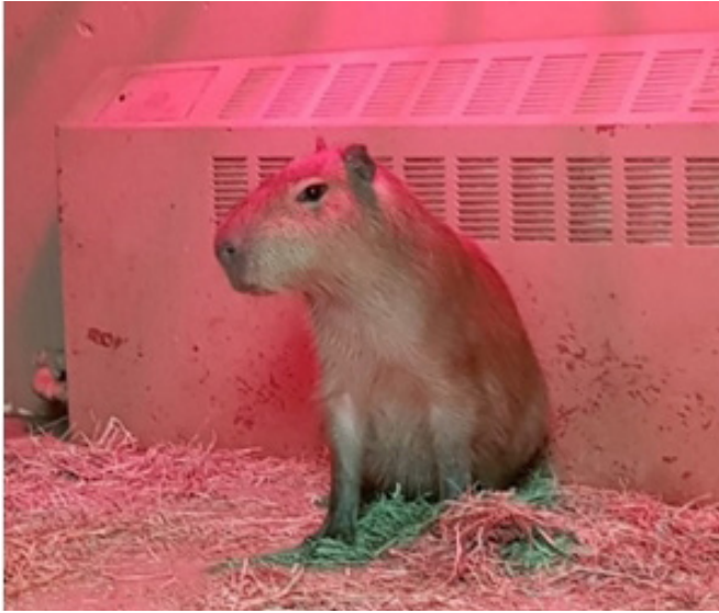
Fig. 1. Female capybara ( Hydrochoerus hydrochaeris ).

in a capybara for diagnosis and treats reproductive diseases of capybaras.