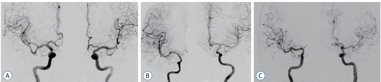
Fig. 1. Measurement methods for the morphology of aneurysm and H-complex variants in the study population. Symmetrical A1 is a case where both A1 arteries have no significant difference (A). In the case of hypoplastic A1, we defined it as A1 on one side with less than half of the diameter of the other side and less than 1 mm (B). Finally, aplastic A1 was defined as a case in which one side of the A1 was not visible on digital subtraction angiography (C).