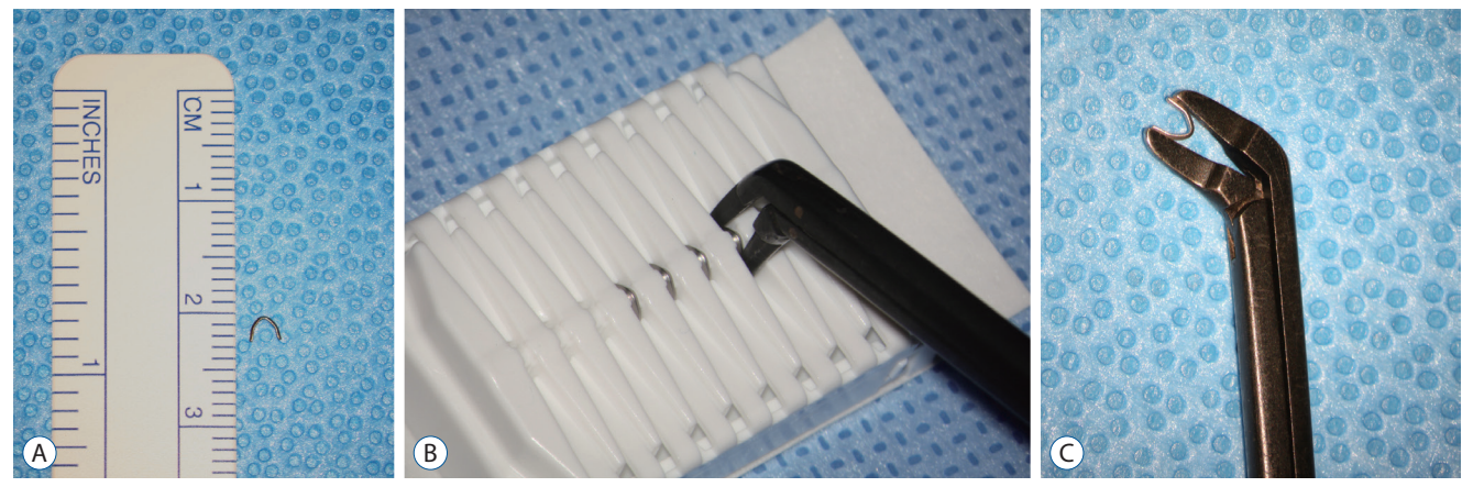
Fig. 1. Photographs of the clips and applier. A : A commercially available 2.6 mm titanium clip is shown. B : Clips are stored in the cartridge. C : Clip is loaded on the tip of applier.

anterior dural edge. And then we clipped the arachnoid membrane together with the dural edge. We used 2.6-mm-long titanium hemostatic microclips (CLIP 9 Vitalitec; Peters Surgical, Bobigny, France) which are cheap (9 clips/pack, 1.55 USD)