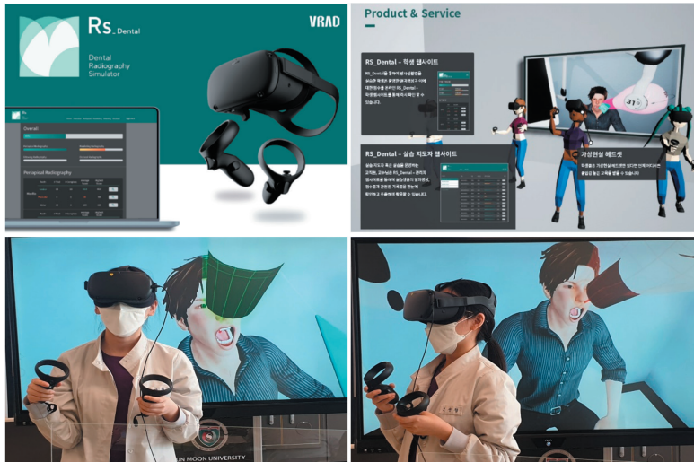
Fig. 1. VR device used in oral radiology practice class and its application

A dental radiography simulator (Rs_Dental) by VRAD was used for VR educational media in this study. The virtual reality-based radiography simulation provided an environment where the students could practice imaging in VR without being exposed to radiation <Fig. 1>.