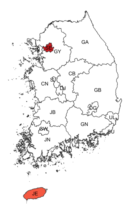
Fig. 1. Regional clusters detected for non-HIV-PcP cases. Light to dark gradient represents increasing order of log likelihood ratio. Area codes represent administrative districts of the Korean government. SE, Seoul; BU, Busan; IN, Incheon; DG, Daegu; GW, Gwangju; DJ, Daejeon; UL, Ulsan; GY, Gyeonggi-do; GA, Gangwon-do; CB, Chungcheongbuk-do; CN, Chungcheongnam-do; JB, Jeollabuk-do; JN, Jeollanam-do; GB, Gyeongsangbuk-do; GN, Gyeongsangnam-do; JE, Jeju-do.

Change in crude rate of PcP in non-HIV and HIV groups according to sex and age are shown in Fig. 3. In the non-HIV-PcP