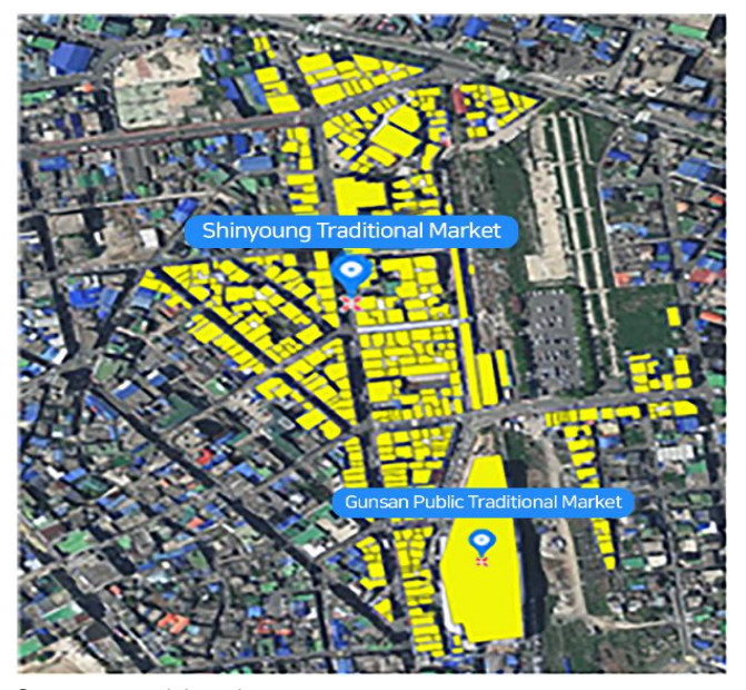
Figure 1: Research Areas(Gunsan Public Market)

Looking at the distribution environment in Jeollabuk-do, 114 traditional markets are located. Among them, 18 traditional markets are located (15% proportion) in Gunsansi, and the sales area is 91,517 m<sup>2</sup>, 13% of Jeollabuk-do. The building area is 41,564 m<sup>2</sup> of 5%. In the case of a large market in Gunsan, two are located within 1.3km to 2km from the commercial district of the study target area. Gunsan-si played a pivotal role in Jeollabuk-do's economy, but the local and alley economy were extensively damaged by the closure of multinational companies (GM 2018.5. Korea).