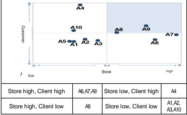
Table 13: Comprehensive Ranking of Measures for Activation