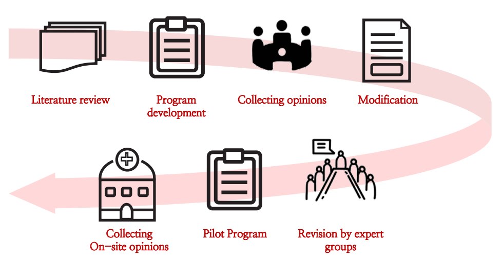
Figure 1. Whole development proces.