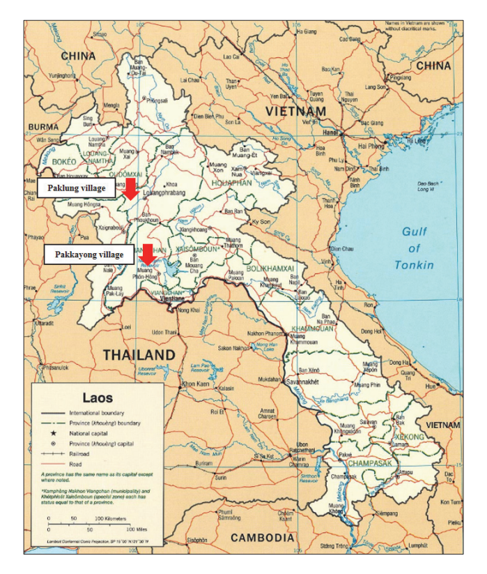
Figure 1. Map of Field Survey Research Area in Lao PDR