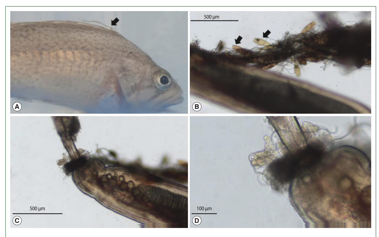
Fig. 2. Photographs (A) and light micrographs (B-D) of Peniculus truncatus -infected Korean rockfish. The black arrows in A and B indicate that the egg strand of Microcotyle sebastis is affixed to the parasitic P. truncatus on the upper fin of the Korean rockfish.