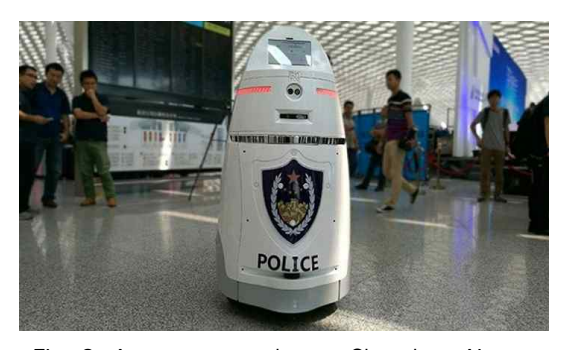
Fig. 3. Autonomous robot at Shenzhen Airport

"AnBot", or "Shenzhen Xiaoan" in Chinese, can move around and react to emergencies