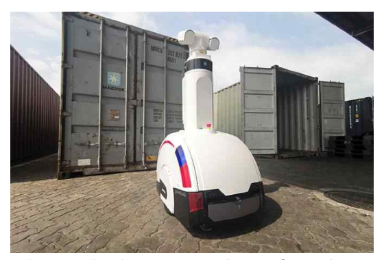
Fig. 4. AR+AI inspection robot at Guangzhou customs district

Another example using AI based robotics is a reform measure of Guangzhou Customs of China (Fig. 4). Guangzhou Customs District has been initiating the AR and AI technologies in