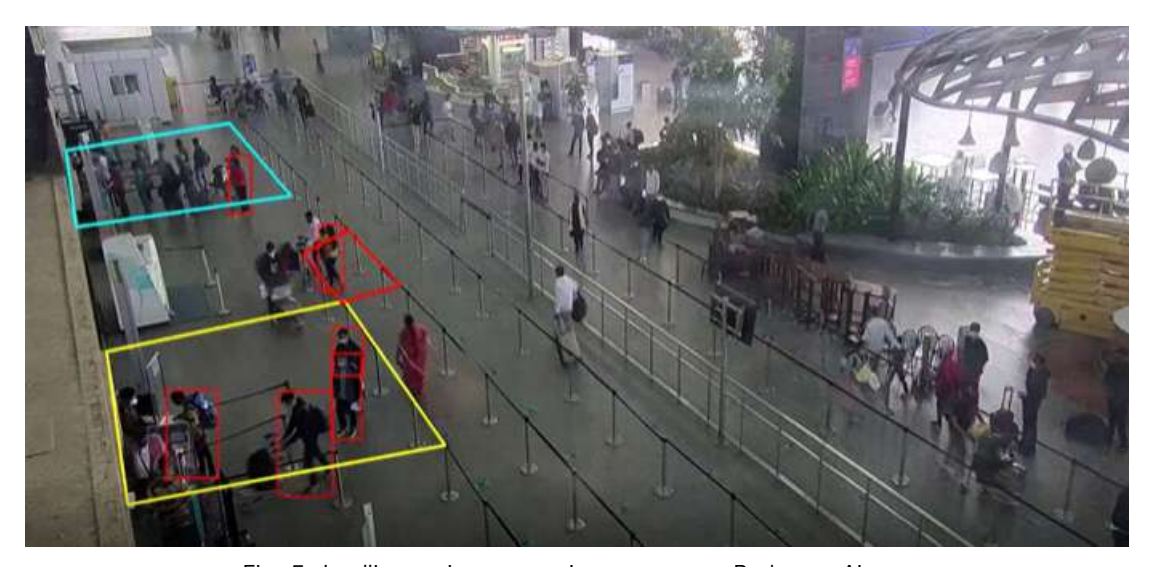
Fig. 5. Intelligent airport security cameras at Budapest Airport

After overcoming COVID-19 pandemic era, international airports are facing the challenge of having to check in the enormous number of passengers while, at the same time, guaranteeing the high level of aviation security standard.