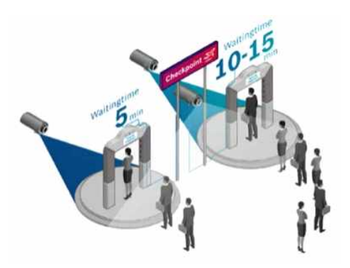
Fig. 6. Smart CCTV increasing efficiency of passenger traffic flow

Smart CCTV analysis with A.I. and IoT applying solutions could provide significant support for airport security.