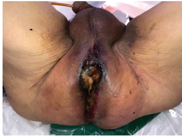
Fig. 1 Initial presentation of the perineal region to the emergency department.