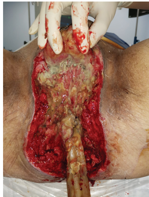
Fig. 2 Hand holding bilateral scrotum up. Persistent soilage of wound.

muscles had to be debrided by the colorectal surgeon (senior author), and resulting in incontinence,