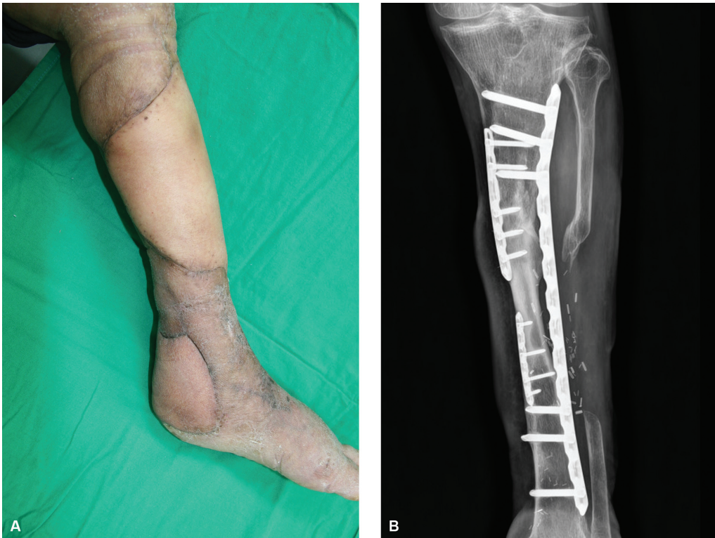
Fig. 4 Long-term follow-up view showed good contour without any debulking procedures (A). Bone union proceeded well and the transferred fibula had hypertrophied by 3 months later (B).

crutch. Moreover, donor site morbidity was insignificant due to the use of two perforator flaps from the lateral thoracic region without sacrificing any muscle.