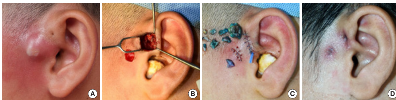
Fig. 2. A 9-year-old boy with postoperative complications and recurrence after non-standardized sinectomy. (A) Preauricular sinus (PAS) with abscess formation on the left ear helical root. (B) Intraoperative view after complete excision of the PAS and incision and drainage scar. (C) Immediate postoperative view of the excised sinus and granulation tissue. (D) Postoperative view at 10 weeks showing intermittent discharge through a tiny opening at the operative site.

Of the 120 ears that were operated on, nine ears (7.5%) exhibited postoperative complications, such as seroma, hematoma, or infection. Specifically, complications were observed in six (13.3%) and three (4.0%) ears in the non-standardized and standardized groups, respectively (Figs. 2, 3); this difference was not statistically significant ( p=0.060 ). Recurrence was observed in six of the 120 ears, indicating an overall recurrence rate of 5.0%. Specifically, recurrence was observed in five (11.1%) and one (1.3%) ears in the non-standardized and standardized groups, respectively,