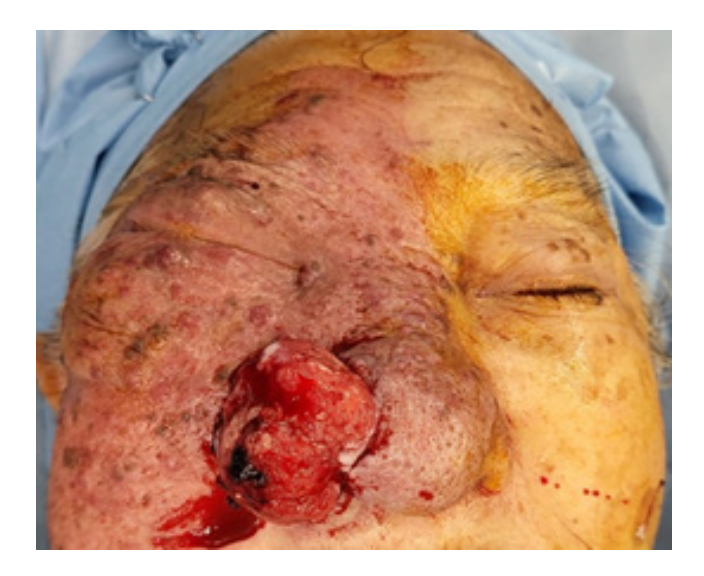
Fig. 1. A 93-year-old woman with a hemangioma on the right hemiface showing a protruding mass on the right nasal ala.

A 93-year-old woman presented at our hospital with a protruding mass in her right nasal ala. Although she had no underlying diseases, such as diabetes or hypertension, she had a capillary malformation on the right half of her face (Fig. 1). The protruding mass appeared on the capillary malformation, and apart from a partial excision performed 15 years previously, no other treatment history existed for the capillary malformation. The