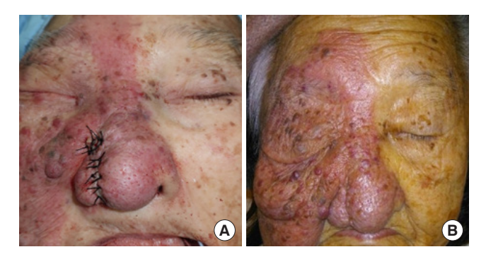
Fig. 3. Postoperative photographs. (A) Immediately and (B) 1 month after the surgery.