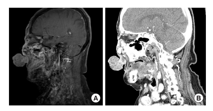
Fig. 2. Preoperative images showing a 3.4 cm exophytic mass with a depth of 2 mm. (A) Magnetic resonance imaging and (B) computed tomography.

Before surgery, magnetic resonance imaging (MRI) was performed to confirm the extent of the lesion. The MRI confirmed a 3.4 cm exophytic mass with a depth of 2 mm, diagnosing it as BCC (Fig. 2). To assess the possibility of metastasis, chest comput-