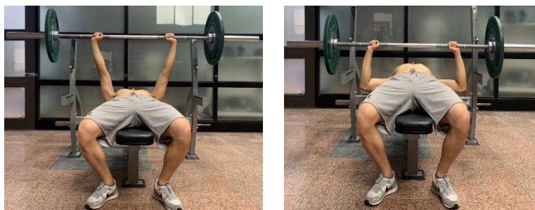
Figure 1. Perform bench press

Bench presses were performed lying down in a five-point contact position on a flat bench. The barbell was held in a closed pronation grip at shoulder-width, fist-width apart. The elbow angle was limited to 90°. Figure 1 is an example of a bench press.