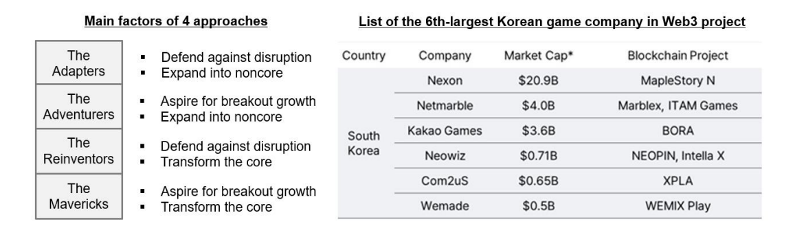
Figure 2. Four Web3 BMI Approaches & Top Six Korean Companies (Jan. 30, 2023)

This study focuses on the Web3 BMI in Korean game industry and the research framework is shown in Figure 2. Above mentioned four BMI approaches can be investigated on several use cases [1, 2].