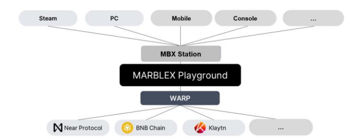
Figure 4. Ecosystem of MARBLEX, the subsidiary of Netmarble

The reinventor approach is to rebalance operations to monetize new superior products in the face of uncertain business growth prospects and issues such as new regulations. Netmarble has a two-track strategy through Klaytn-based BC game platform, MARBLEX and BSC-based entertainment content platform, ITAMCUBE [25]. MARBLEX as a BC subsidiary, is a kind of new product. Netmarble aims to overcome the slowdown in game market growth. As shown in Figure 4, MARBLEX selects a publishing business based on a multi-chain structure for market expansion. Because of the limitations of the side chain structure connected to the single BC, Klaytn, MARBLEX started to connect to various BCs through its own bridge service, WARP to create a multi-chain foundation that increases user accessibility, and BNB Chain, Near Protocol, and Aptos Foundation joined. The publishing business was launched for the first time in Korea by Netmarble. MARBLEX also provides services like NFT minting, token management, DApp service connection, and wallet linkage at MBX. On this, 3rd party game developers can focus only on game development and onboarding them to the MARBLEX ecosystem [14, 26]