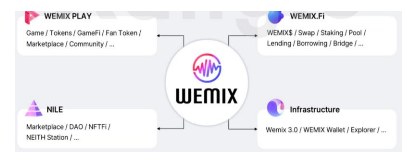
Figure 5. Wemade's Wemix ecosystem

Wemade unveiled the potential of BC game very proactively and thanks to the success of "Mir 4 Global," it has secured large users. In October 2022, it released its own mainnet, "Wemix 3.0" on layer 1 which is expected to expand the ecosystem through three major platforms like blockchain game platform 'WemixPlay', 'NILE' that can create and manage 'decentralized autonomous organizations (DAOs)', and 'Wemix.Fi' that can be used for Defi service based on the infrastructure of 'Wemix3.0'. Figure 5 shows the Wemix ecosystem. As of July 2023, WemixPlay has operated ca. 30 games, Wemix.Fi offered services like stablecoin (Wemix Dollars), swap, staking, and lending. 'NFT Is Life Evolution (NILE)', a NFT platform, provides joint investment and NFTi services using marketplace and DAO [12]. The reason why Wemade launched its own chain is primarily to maximize the value that occurs across the blockchain. With the introduction of Wemixchain, WemixPlay, WemixFi, and WimixDollar, Wemix will be able to directly operate and expand the value chain throughout the BC ecosystem.