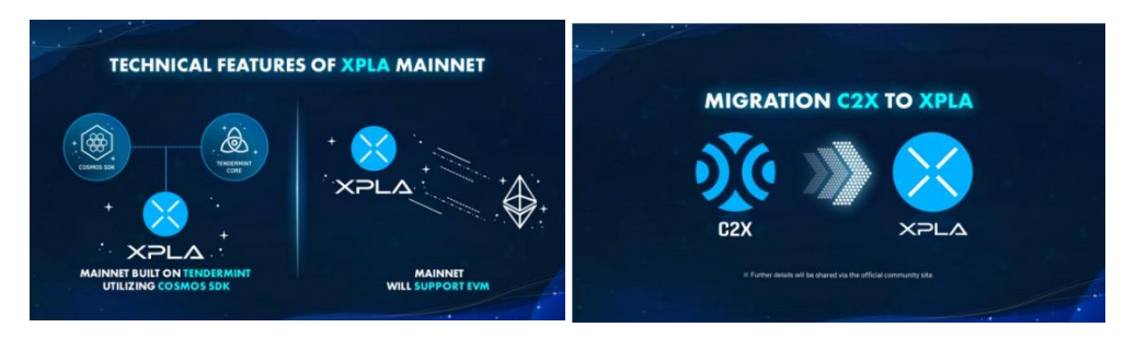
Figure 6. Technical Features of XPLA Mainnet

and has a governance coin status, and the existing C2X platform remains [30].