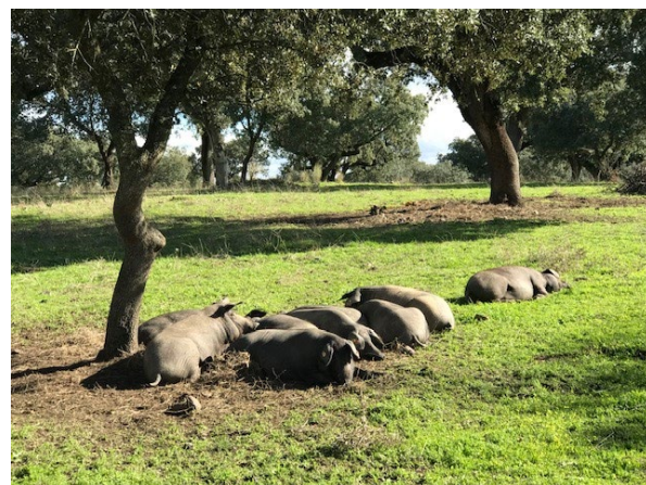
Figure 2. Iberian pig production (Spain), rearing under free range conditions.