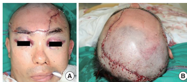
Fig. 4. Immediate postoperative photographs. (A) Frontal view. (B) Top view.