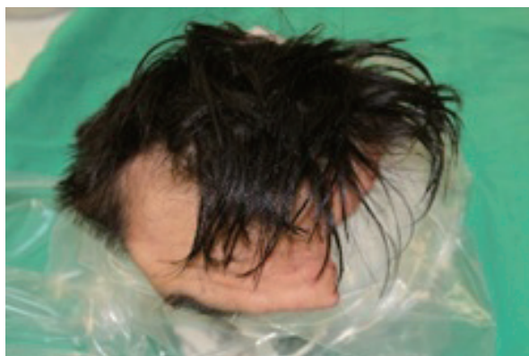
Fig. 2. Avulsed scalp before preparation using rapid prototyping model for orientation and sterilization.