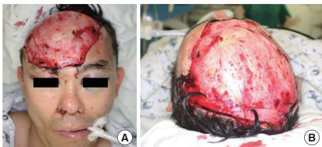
Fig. 1. A 44-year-old man with a traumatic scalp avulsion. (A) Frontal view. (B) Top view.

Initially, we planned to use heparin for flap survival. However, because of a hemorrhage in the frontal lobe, no anticoagulant or antiplatelet agents were systematically applied during or after the surgery. Blood transfusion was administered until postoperative day 1 with fluid resuscitation management according to